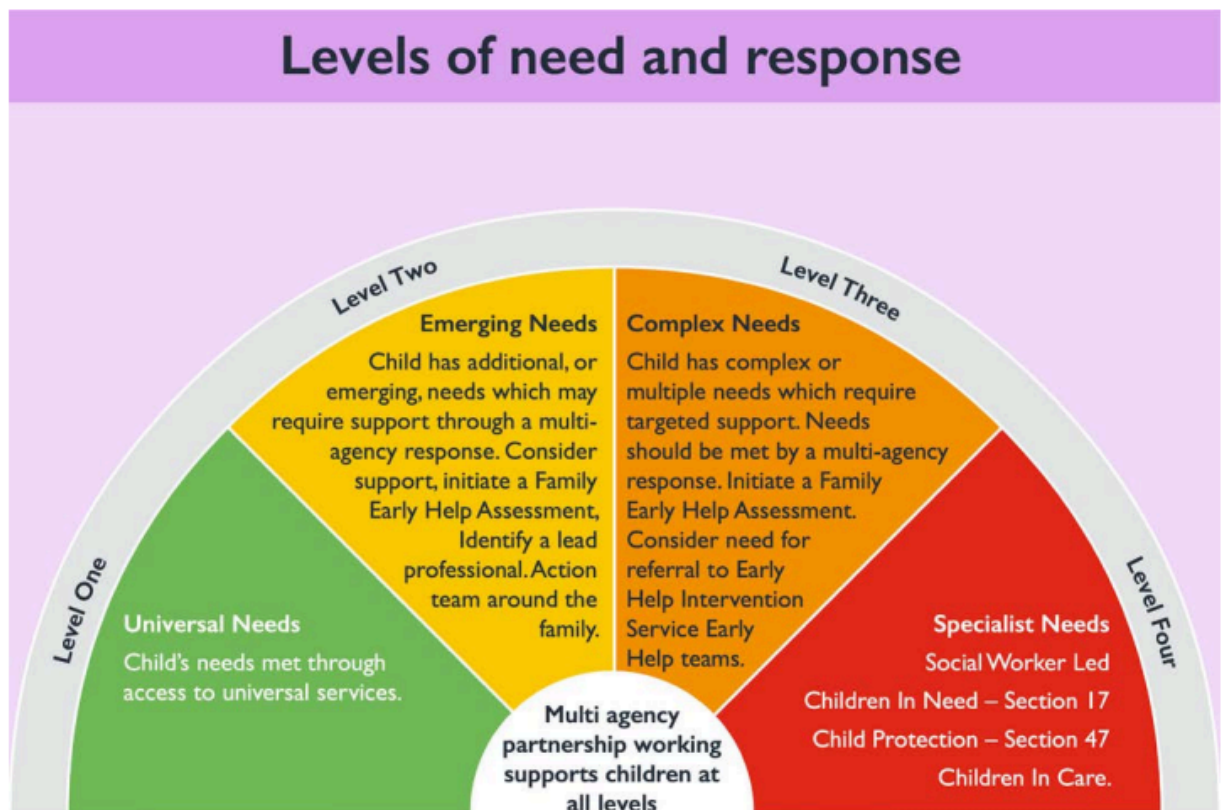
Fig 1b: City of York Council – levels of need